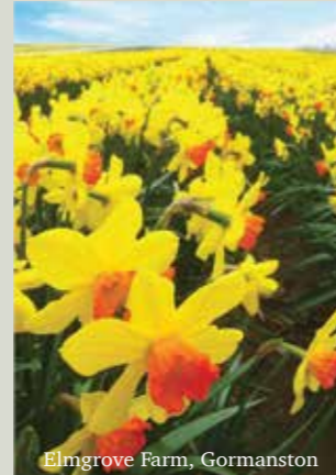
Elmgrove Farm, Gormanston