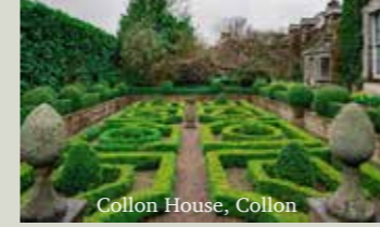
Collon House, Collon