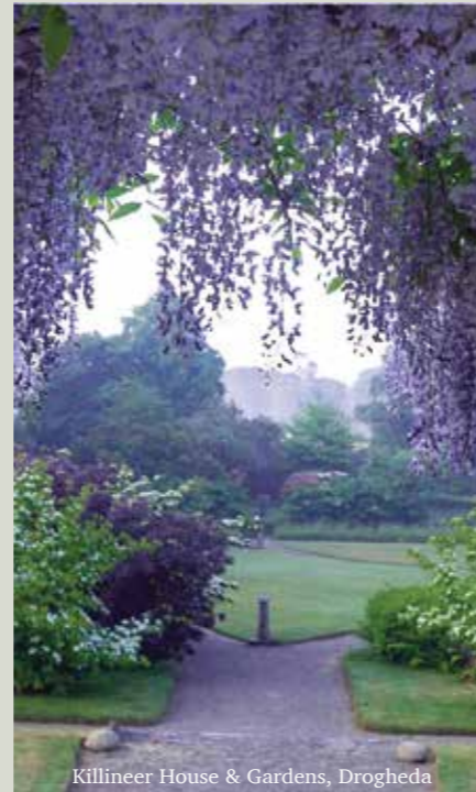
Killineer House & Gardens, Drogheda