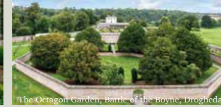
The Octagon Garden, Battle of the Boyne, Drogheda