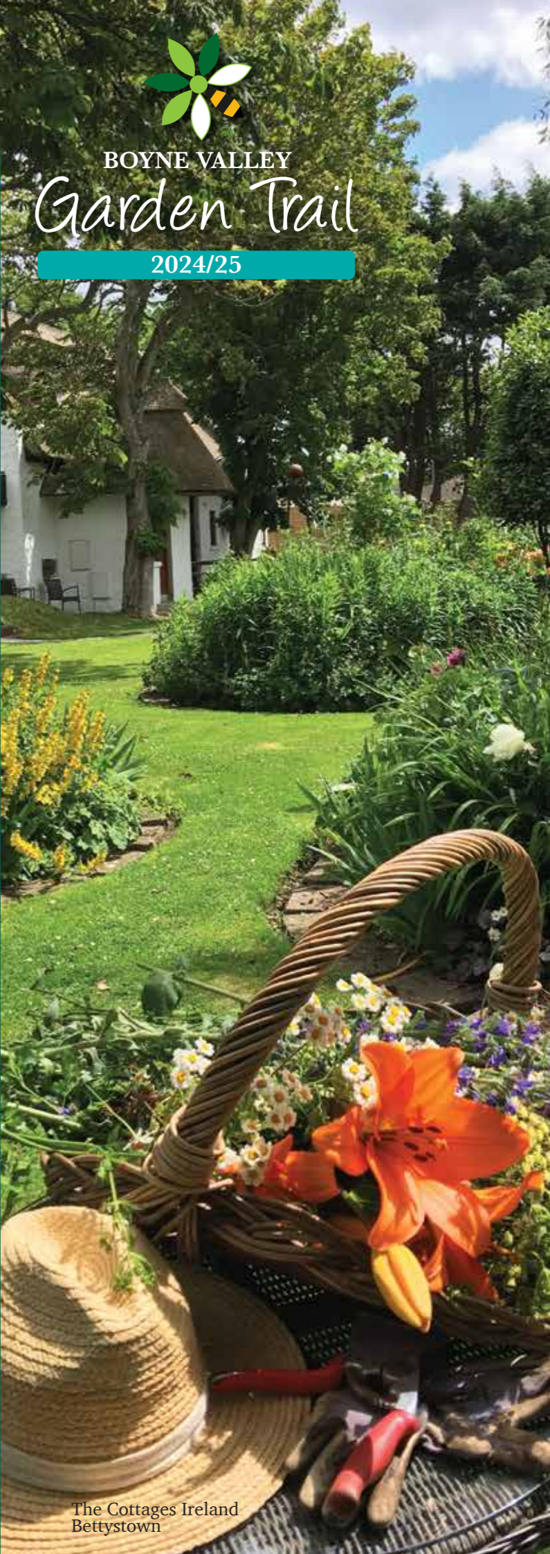
The Cottages Ireland Bettystown