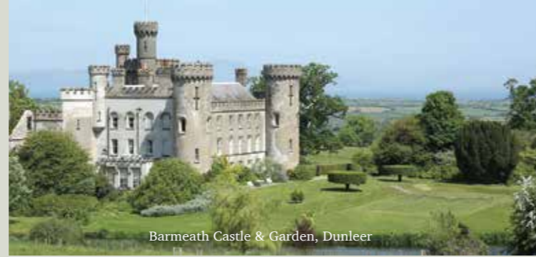
Barmeath Castle & Garden, Dunleer