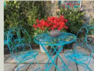
The Poppy Garden, Oldeastle