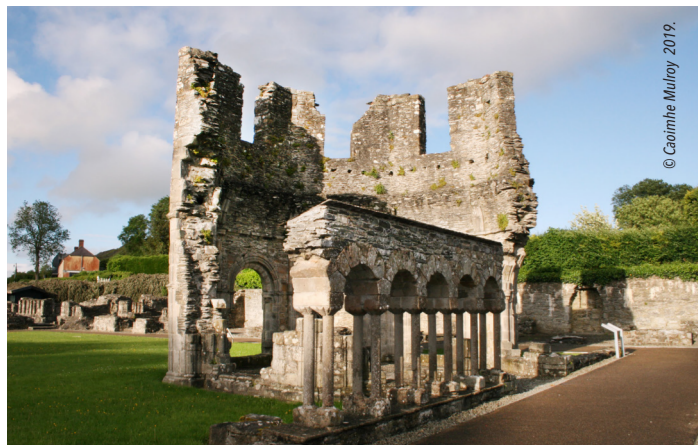
MELLIFONT ABBEY - 1142