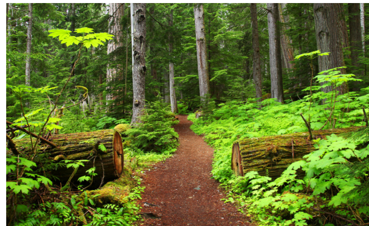
TOWNLEY HALL WOOD