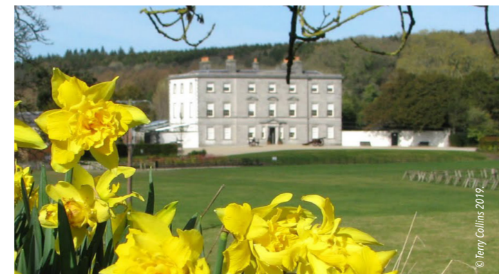
OLDBRIDGE HOUSE - 1750