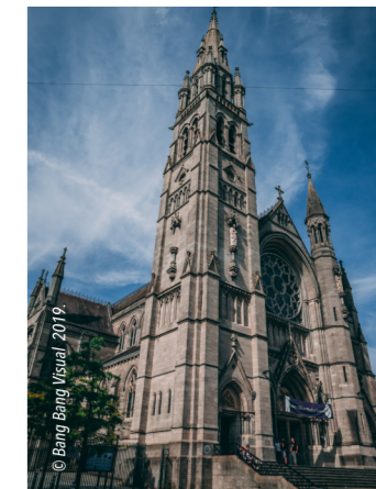
ST. PETER'S RC CHURCH