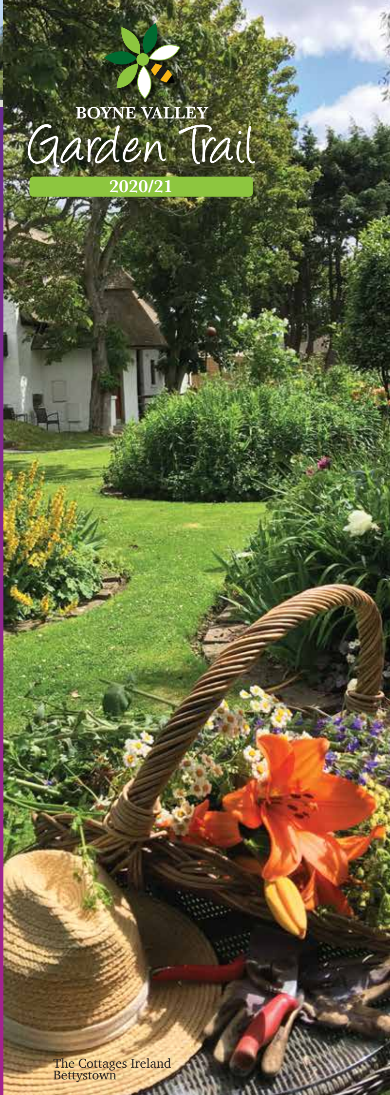
The Cottages Ireland Bettystown