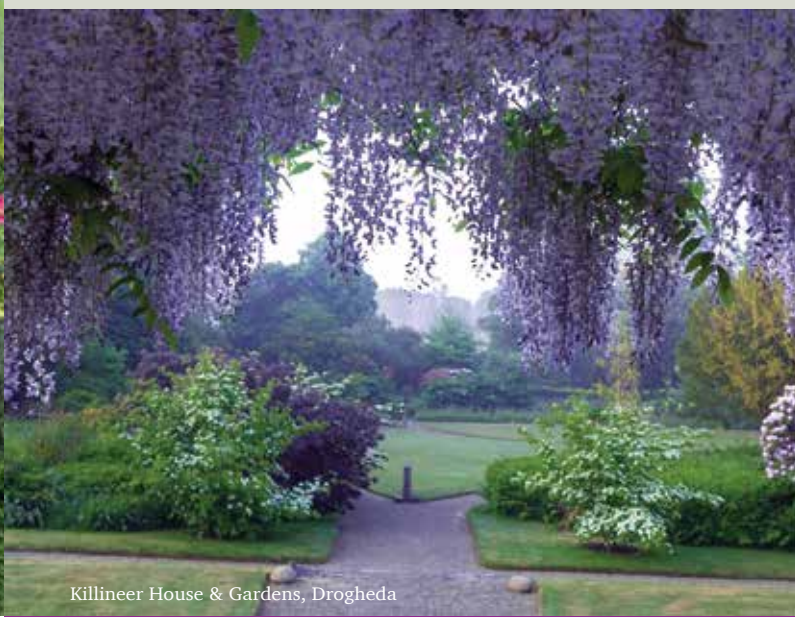
Killineer House & Gardens, Drogheda