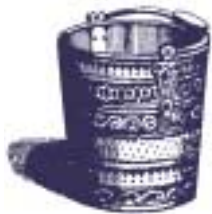
A ornamental bucket believed to be of 9th century origin found in the Clonard river

on its northern face. The builder's name, Jas Bell, and the date 1808, are inserted in the church tower. A stone corbel-head, inserted into the tower above the door, is believed to have survived from a previous church, perhaps even the monastery. Originally it boasted of a hot air system of heating by means of an under floor furnace with overhead grills. The entrance to this furnace was outside underneath the east window. Later piped hot water central heating was installed and the necessary furnace for it was built behind the tower. There are many very old headstones in the graveyard some dating back to the 1690's. Local catholic families were interred here in bygone days.