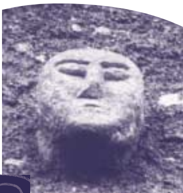
Church of St. Finian The Church of St. Finian is said to have been built on the 6th century monastic site

on its northern face. The builder's name, Jas Bell, and the date 1808, are inserted in the church tower. A stone corbel-head, inserted into the tower above the door, is believed to have survived from a previous church, perhaps even the monastery. Originally it boasted of a hot air system of heating by means of an under floor furnace with overhead grills. The entrance to this furnace was outside underneath the east window. Later piped hot water central heating was installed and the necessary furnace for it was built behind the tower. There are many very old headstones in the graveyard some dating back to the 1690's. Local catholic families were interred here in bygone days.