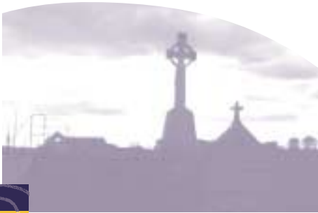
The Croppies Grave The dead from 1798 from the battle of Clonard