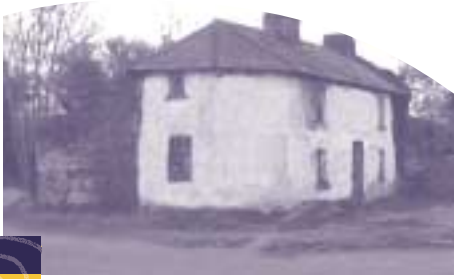
The Toll House also known in the area as The Coffin House