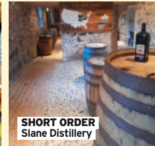
SHORT ORDER Slane Distillery