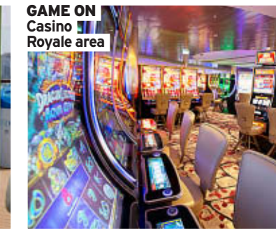
GAME ON Casino Royale area