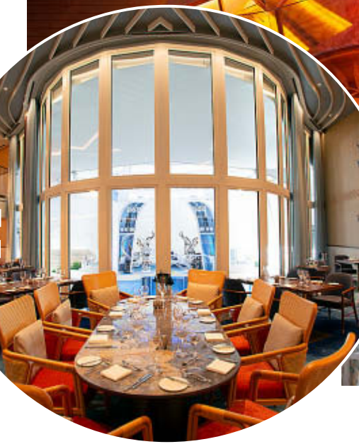
FINE DINING Coastal Kitchen