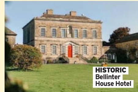
HISTORIC Bellinter House Hotel

Central Bar, Navan, for a T-Bone steak, and was treated to a tour. The Central is deceptive - compact and cosy on first impressions, but also reveals two outdoor areas, two restaurants, a sports bar and a secret watering hole. The next afternoon saw a trip to Slane Whiskey Distillery, where the bar is decorated with records of all the famous artists such as Guns N' Roses, David Bowie, Bob Dylan and Harry Styles who have played at Slane Castle. To be walked through the intricate process of whiskey-making was fascinating. But the real treat was the tasting of the end. My high society weekend was topped off with a trip to Conyngham Arms Hotel, which, with its green walls and white furniture, was like something out of a doll's house. Meath is, of course, celebrated for its history - not least Newgrange and The Battle of the Boyne. There's a magic to the Boyne Valley, I'm glad I discovered. Boyne Hurdle Day is at Navan Racecourse on February 11. For more information about Meath - home of Ireland's ancient east - see www.discoverboynevalley.ie/