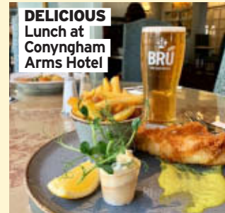
DELICIOUS Lunch at Conyngham Arms Hotel