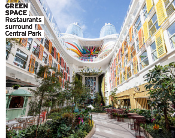
GREEN SPACE Restaurants surround Central Park

7,600 passengers. Crammed into its 18 passenger decks are eight separate "neighbourhoods", plus more than 40 restaurants, bars and lounges, as well as seven pools. I'm used to big ships, having sailed on most of Royal Caribbean's Oasis-class vessels, which previously held the record. Even so, as I boarded in Miami I was still overwhelmed by Icon's size. I toured the biggest suite, the Ultimate Family Townhouse, which is three decks high, can sleep up to eight people, and is fitted with a slide, movie area, two private balconies and even a patio with table tennis. At a peak rate of €76,000 a week, it's already sold out for the rest of this year.