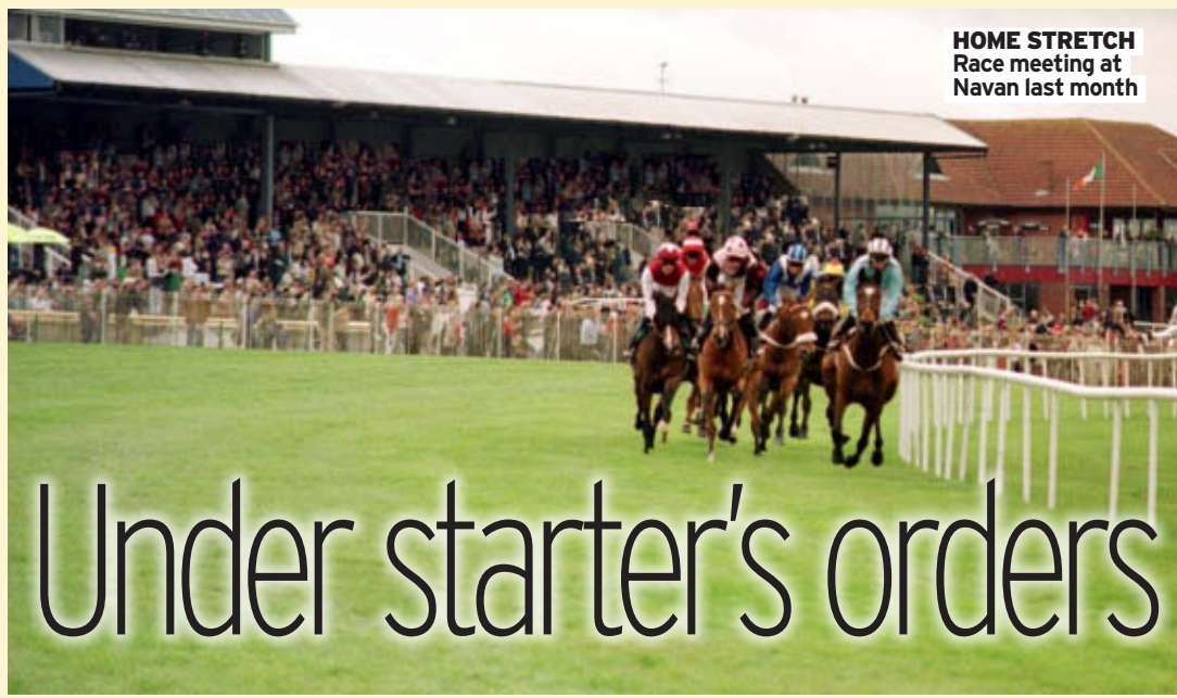
HOME STRETCH Race meeting at Navan last month