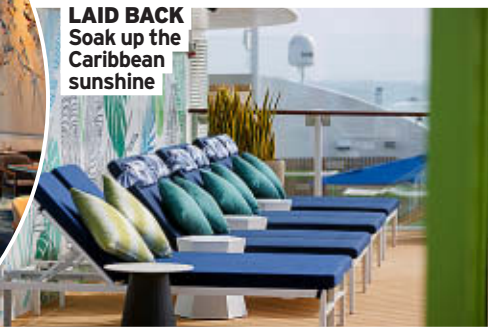
LAI D BACK Soak up the Caribbean sunshine